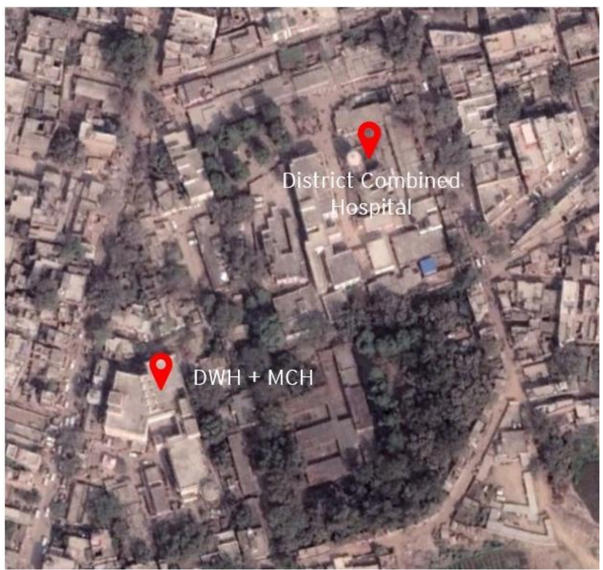
Site demarcation for District Hospital